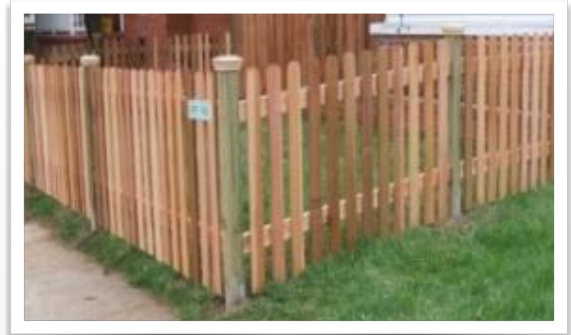
Design Example: Open weave

Fences built with valid permits prior to the effective date of this chapter or fences on properties annexed to the City after the effective date of this chapter are exempt.