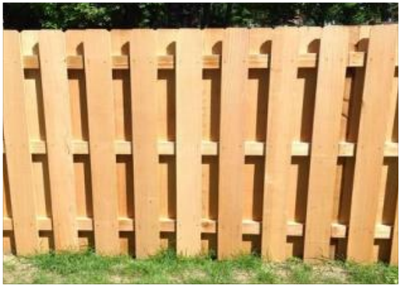
Design Example: Shadowbox

All fences shall have the finished side facing out with post and supports to the inside.